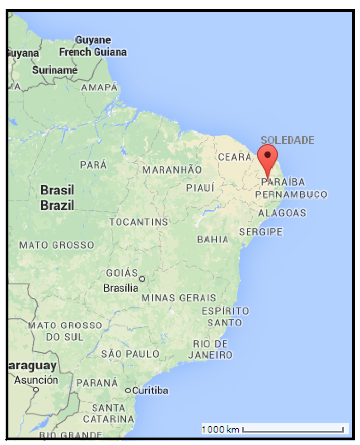
Figure 1. Location map of the Soledade City, State of Paraíba, Brazil. Adapted from Google Maps.

portion of three adult individuals arranged randomly in the population, since fully exposed to light intensity, accounting for a total of nine replicates in each population. During the procedure using always the same leaves throughout the experiment, one leaf was placed clip retaining a portion of the leaf area covered free of luminous