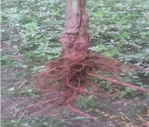
Figure 2. Sampled Root of A. hybridus containing galls.