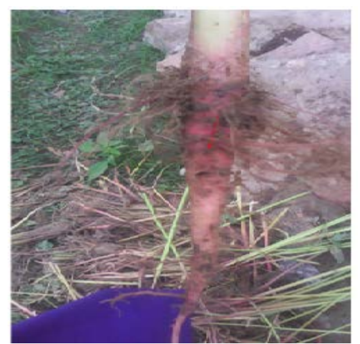
Figure 3. Sampled root with feeding disposition Figure 4. Pratylenchus. and portal entry of the parasitic nematodes