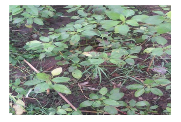
Figure 1. Poor yield of infested green amaranth in Farm 2.