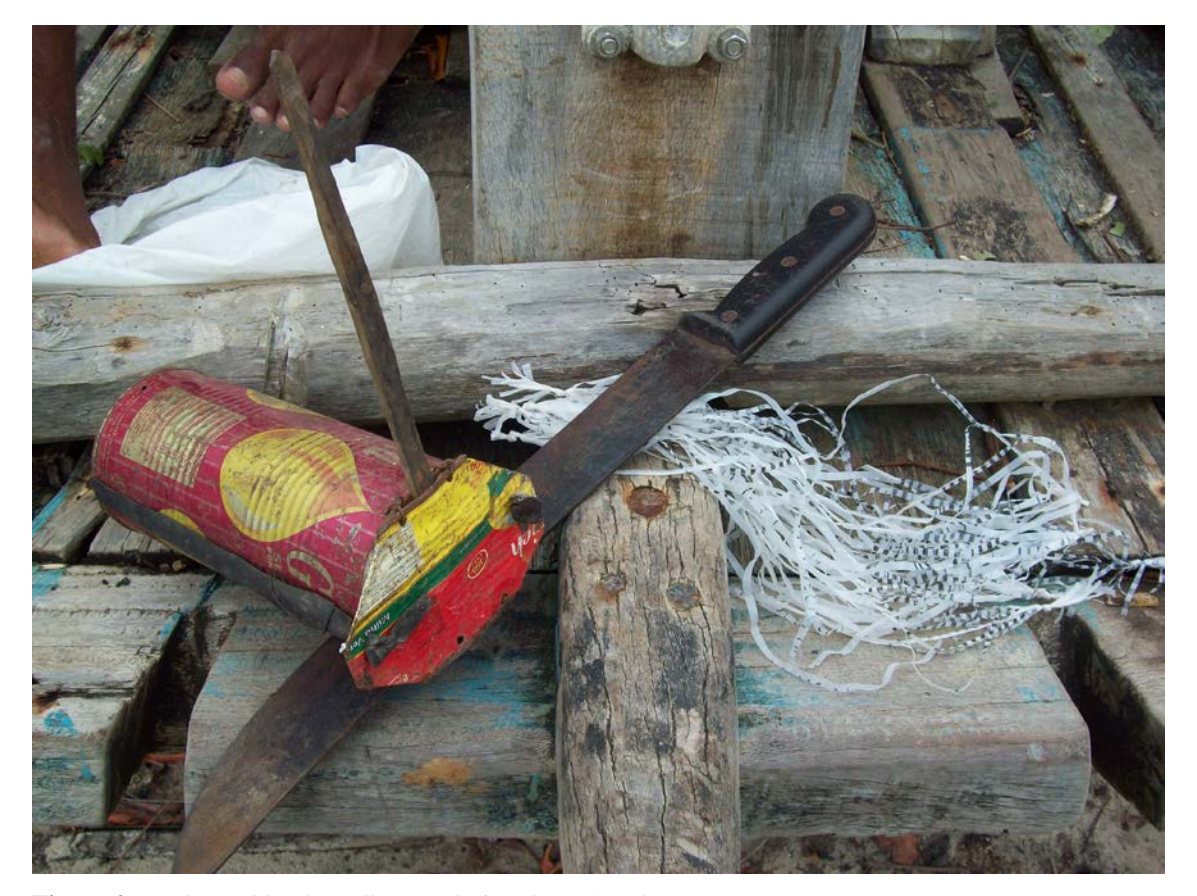
Figure 2. Tools used by the collectors during the uçá-crab capture.

During crab collection, the animals are captured by a mousetrap, machete and or "braceamento" (using the arm) (20%), although 80% use the "redinha" (little-net technique) (Figure 2). The use of little-net by the collectors to capture the crab has caused the decrease of the species (Table 1). These techniques were reported by other authors who discussed the ethnobiological and socio-economic issues relating to the crab collectors (Albuquerque and Albuquerque, 2005).