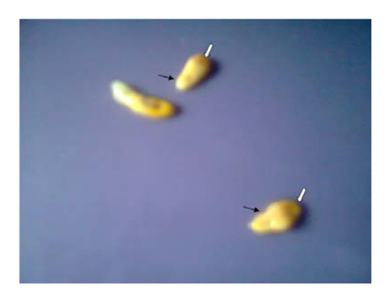
Figure 2 . Live metacercariae of Clinostomum Morphotype1 showing two body colorations.

Season influenced the occurrence of Morphotype1 with higher prevalence in dry (54.01%) than rainy (45.98%) season months with highest prevalence in January, November and April (10.71%) and lowest in September (5.36%).